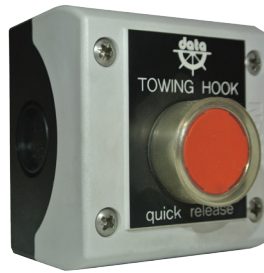
Towing hook release button for deck