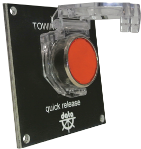
Towing hook release panel for wheel house