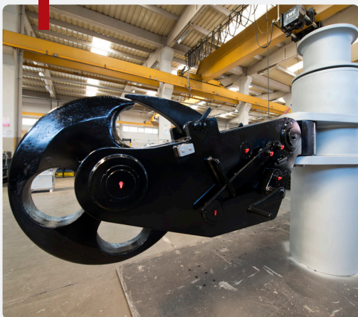
Towing hook foundation with integrated manoeuvring capstan

Disc type towing hooks can be integrated with shock absorber springs.