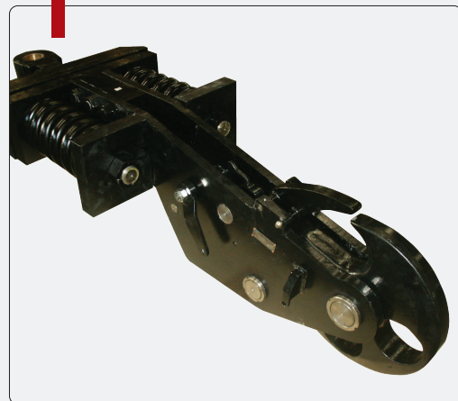
Disc type towing hook with shock absorbers