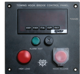
Towing hook wheelhouse control panel with load monitoring display unit